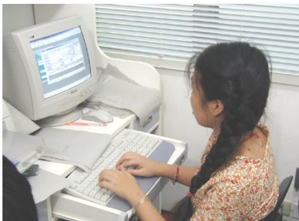
Volunteer staff worker doing data encoding.