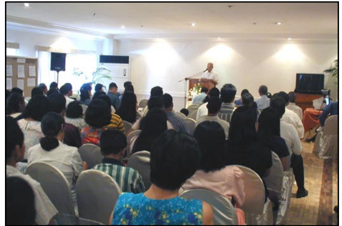
Neighboring churches combine for Pentecost at the Apo View Hotel in Davao City

downtrend, unrest, and unemployment we face, God still blessed us with an almost 30 percent increase over the previous year.