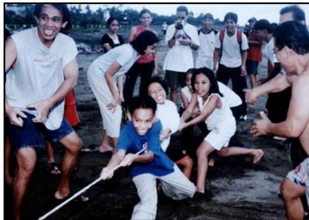
Top: Young adults and children perform Filipino folk dances during the Family Night at the Iloilo Festival site; Above: Children enjoy a friendly game of ‘tug-of-war’ during the Family Day activity in Iloilo