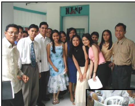
Top: Members of the Davao Festival choir as they prepare for a special music rendition; Right: Senior members play a vital role in God's Church

The Variety Show showed that a lot of practice, ingenuity, creativity, and heart were put into its preparation. The Family Day was a feast of God's bounty both for the eyes, the belly and the soul. And finally, new bonds among brethren were forged and old ones reinforced. That took care of spiritual sustenance.