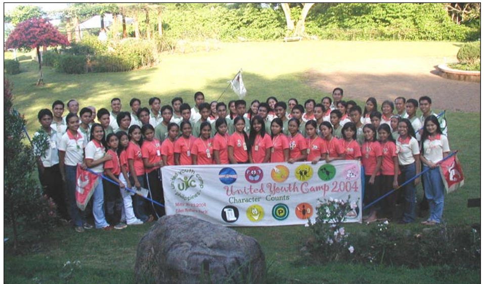
A group shot of the UYC 2004 Philippine campers and staff

The day began at 5 a.m. with “Quiet Time,” a time for prayer and Bible study. Then at 6 a.m., campers would shower, get ready, and prepare breakfast. Each