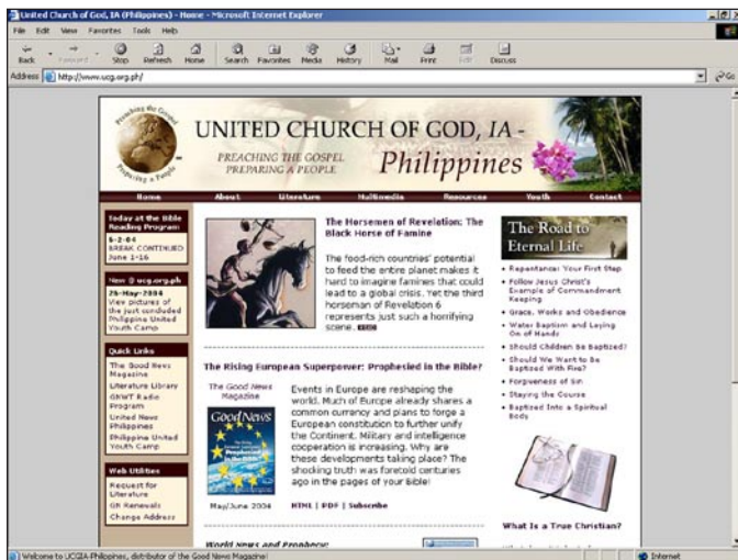
Home page of the UCGIA-Philippines Web site